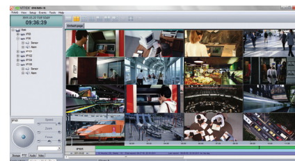
ENVI Enterprise Network Video Recording Solutions