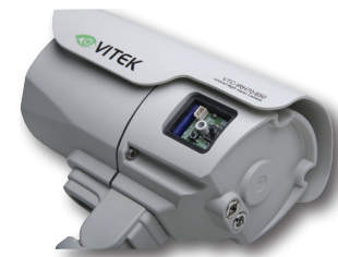
VTC-IRE70/650IP2 Side Compartment