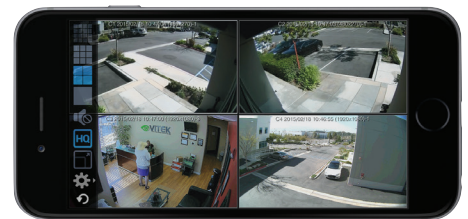
Apps Available for iPhone, iPad, & Android Devices