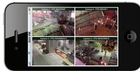
Apps Available for iPhone, iPad, & Android Devices