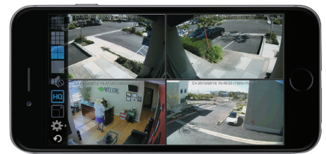
Apps Available for iPhone, iPad, & Android Devices