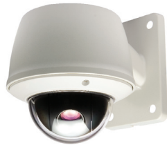
Optional Wall Mount