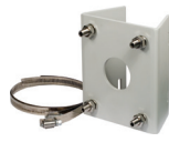
VT-PTPLMT PTZ Pole Mount Adapter