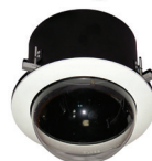
VT-PTFMK PTZ Flush Mount Kit w/ Clear or Smoked Bubble