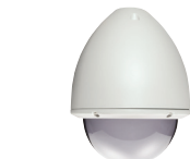
VT-PTHSG/IP PTZ Housing w/ Clear or Smoked Bubble