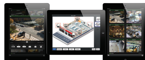
ENVI Mobile App ENVI Remote Viewing App for iPad/ iPhone & Android Devices