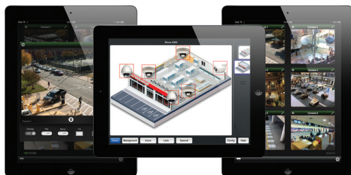
ENVI Mobile App ENVI Remote Viewing App for iPad/iPhone & Android Devices

The VITEK ENVI Series Outdoor 2.1 Megapixel IP Cameras offer Weather/Vandal Resistance and deliver real time live video up to 30fps @ 1920x1080p over a TCP/IP Network. Crystal clear images are achieved without tearing by use of a progressive scan CMOS image sensor. Minimal network bandwidth and storage space is needed due to the most advanced H.264 Video Compression algorithm. Motion JPEG is also supported for maximum flexibility and integration possibilities. All ENVI cameras also offer EDGE Recording with onboard SD or MicroSD card slots for on camera backup with remote access & playback.