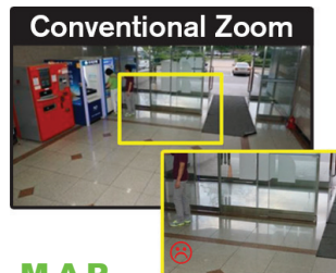
M.A.P. Motion Activated Pointing Zoom Feature