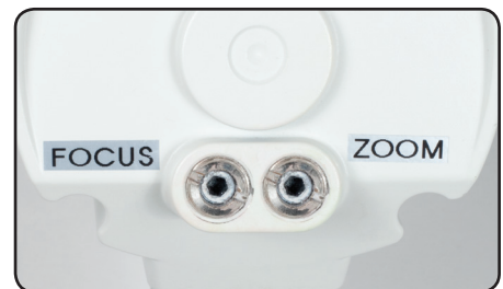
Gasket sealed externally adjustable Focus & Zoom with clutch to eliminate over-tightening.