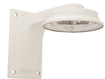
VT-MV/WMT Wall Mount