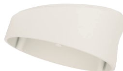
VT-MV/TB 15° Degree Tilted Surface Mount Base