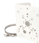
VT-MV/PLMT Pole Mount Adapter