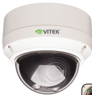
Shown with Included Surface Mount Base