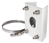
VT-MDPLMT Mighty Dome Pole Mount