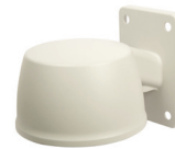
VT-MD/WMT Mighty Dome Wall Mount