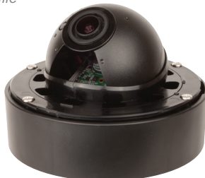
Friction Fit Ball Mount Camera Module with New Improved Easy Access Lens Controls, Can Achieve Virtually Any Viewing Angle