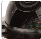
Easy to access lens adjustment controls.