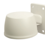
VT-MD/WMT Mighty Dome Wall Mount