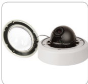
Fully Gasket Sealed with an IP-68 Water tight NEMA Rating