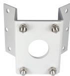
VT-MD/CNMT Mighty Dome Corner Mount