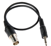
VT-MD/2VOC Secondary Video Output Cable (Included)