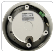
The Mighty Dome Vandal base has been designed to manage and protect video and power cables without the need for external adaptors.