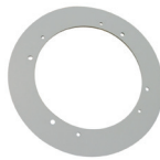
VT-MD/FMP Flush Mount (use with 4-11/16 in. Square Boxes, 2-1/8 in. Deep - Welded with Conduit KO's)