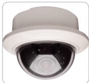
May be Surface (with included Surface Mount Ring) or Semi-Flush Mounted for Sleek, Low Profile Installation.