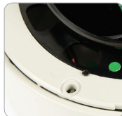
Secondary Video Output Enables Ease of Adjustment after Installation (Cable Included)