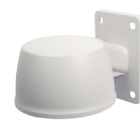
VT-MD/WMT Mighty Dome Wall Mount