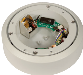
UTP Interface and Heater & Blower Options Available