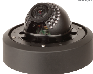
Friction Fit Ball Mount Camera Module with New Improved Easy Access Lens Controls, Can Achieve Virtually Any Viewing Angle