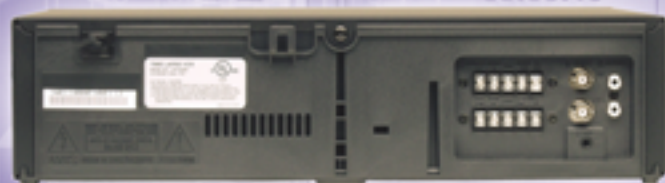
Rear Of Recorder Remote Control